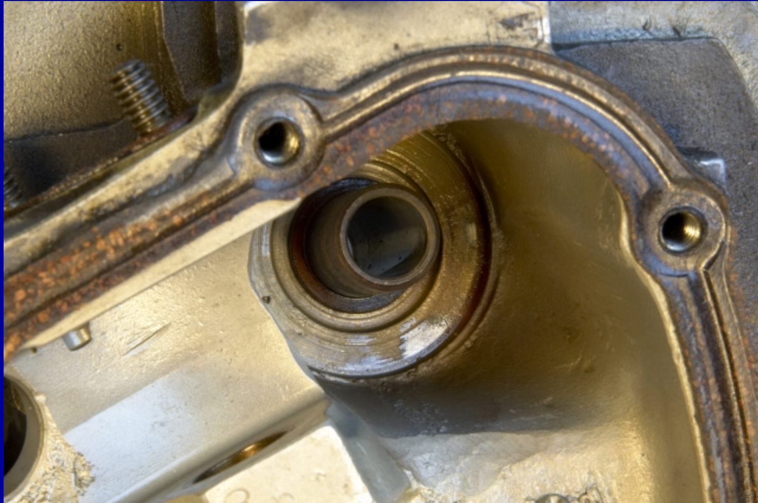
Figure 1. CamGuard Certification Engine – 531 hours

Exhaust valve guide – No deposits and 0.0002 wear typical for this engine