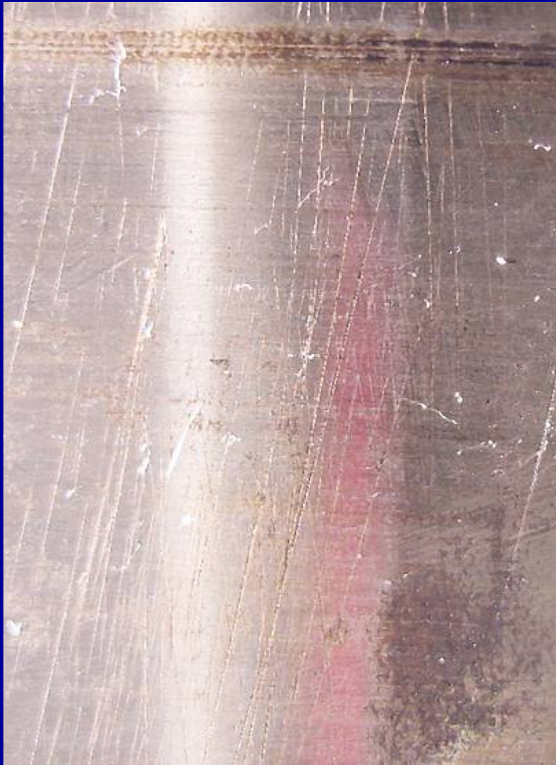
Figure 3. Example of a severely worn Continental IO-520 cylinder at 740 hours.