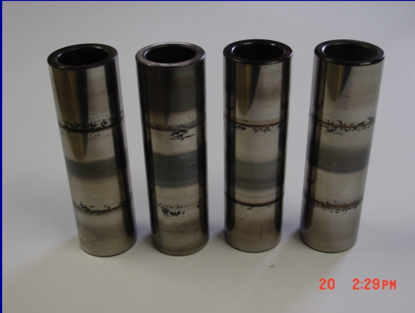
Figure 6 Example of corroded rocker shafts (typical w/o CamGuard Use).