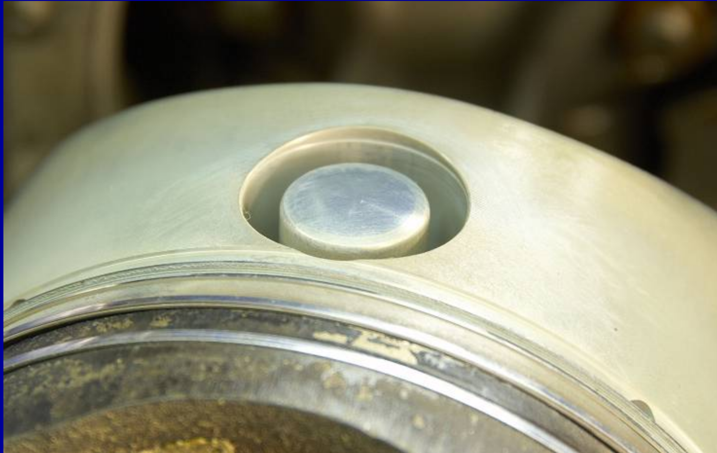
Figure 2. CamGuard Certification Engine – 531 hours